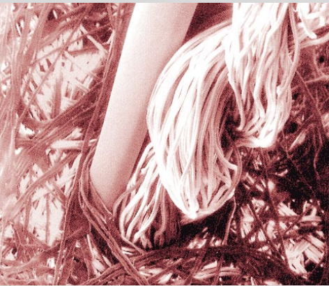
▲ During tufting the continuous fibers of Typar® are not damaged but displaced to form a reinforcing collar around tufts.

DuPont™ Typar spunbonded polypropylene enables the production of high quality carpets with even the most critical designs and offers distinctive advantages versus woven backing materials.