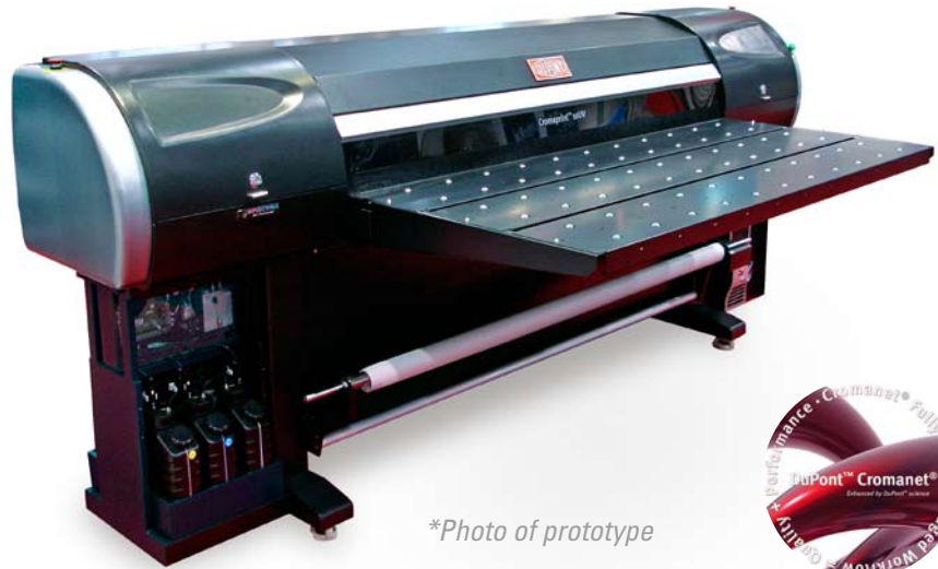
*Photo of prototype

Quality, versatility, speed, and a company philosophy dedicated to technology innovation and customer support set Cromaprint™ UV apart in the growing inkjet marketplace.