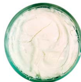
In oven at 232°C (448°F) for 40 hr: Krytox® — 0% wt loss

Krytox® lubricants are more effective at even higher temperatures, regardless of operating duration. Using base oils, thickeners, and additives with chemistry designed to create high and low viscosity, these products are targeted for use solely in the very high-temperature range. Available in several grades that offer anticorrosion, extra bonding, and non-melting properties, these lubricants have applications in a variety of industries, including chemical, textile, tire, aviation, conveyor, glass, plastic film, non-woven manufacturing, and mining and metal processing.