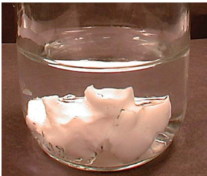
Krytox® grease in hydrocarbon solvent is not dissolved.