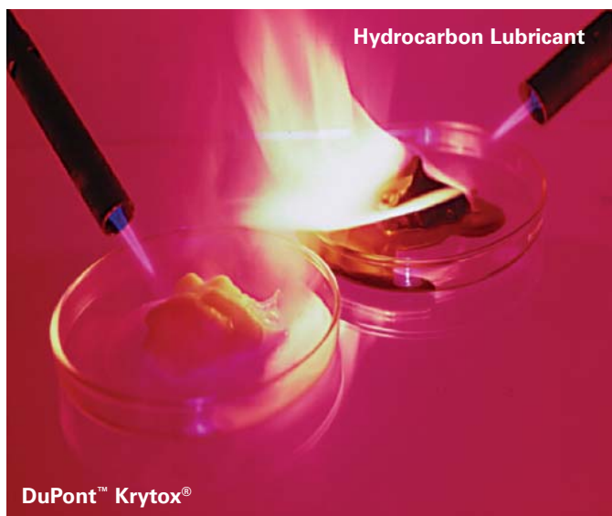
Hydrocarbon-based lubricants burn; Krytox® does not.