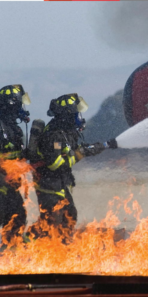
Firefighting Skills Training.