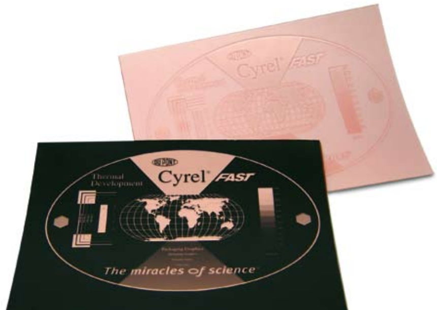
DuPont™ Cyrel® DFS