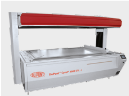
DuPont™ Cyrel® 3000 ETL-i