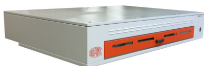
DuPont™ Cyrel® 3000 LF

DuPont Packaging Graphics continues to be a global technology leader in the development and supply of flexographic printing systems. Our R&D team continues to develop innovative new solutions to help our customers expand their business by taking advantage of new and profitable opportunities in the growing flexographic packaging market. The DuPont Packaging Graphics portfolio of products includes DuPont™ Cyrel® brand photopolymer plates (analogue and digital), Cyrel® platemaking equipment, Cyrel® round sleeves, Cyrel® plate mounting systems and the revolutionary Cyrel® FAST thermal system.