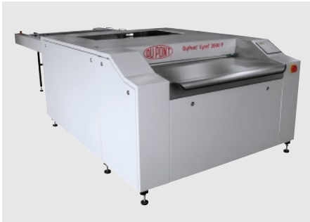
DuPont™ Cyrel® 3000 P