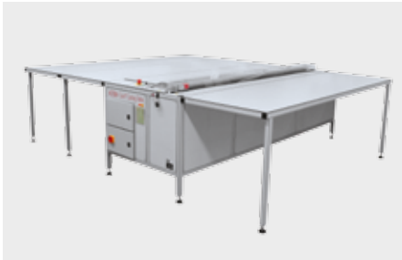
DuPont™ Cyrel® Cutting Table 2100 mm