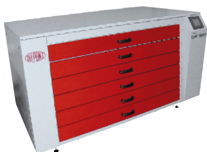
DuPont™ Cyrel® 2000 D

DuPont Packaging Graphics continues to be a global technology leader in the development and supply of flexographic printing systems. Our R&D team continues to develop innovative new solutions to help our customers expand their business by taking advantage of new and profitable opportunities in the growing flexographic packaging market. The DuPont Packaging Graphics portfolio of products includes DuPont™ Cyrel® brand photopolymer plates (analogue and digital), Cyrel® platemaking equipment, Cyrel® round sleeves, Cyrel® plate mounting systems and the revolutionary Cyrel® FAST thermal system.