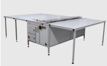
DuPont™ Cyrel® Cutting Table