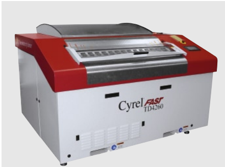
DuPont™ Cyrel® FAST TD 4260