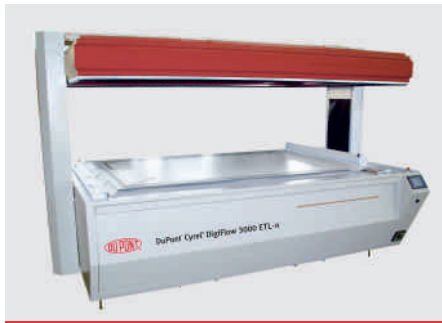
DuPont™ Cyrel® DigiFlow 3000 ETL-n