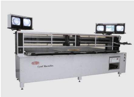
DuPont™ Cyrel® Macroflex