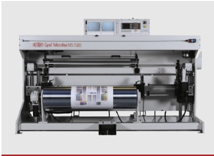
DuPont™ Cyrel® Microflex 1320