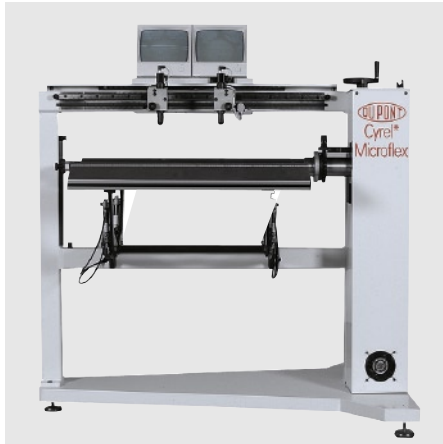
DuPont™ Cyrel® Microflex 850