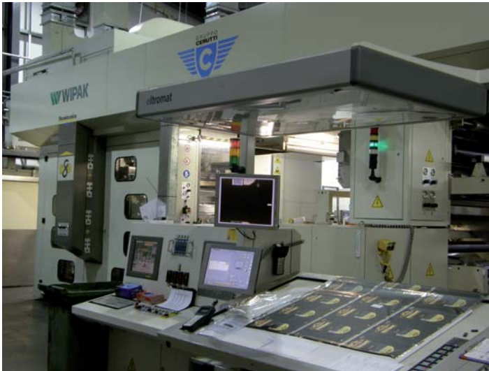
"Wipak's latest press, the Flexotecnica, uses Cyrel® round and the Eltromat automatic register system to deliver outstanding register - fast."

Early in 2009, PPP reinforced its partnership with Wipak in Welshpool (The UK subsidiary of the Wipak Group, the packaging division of Wihuri a Finnish multinational group of companies) and consolidated an already successful relationship to drive changes in the UK Flexible Packaging market; PPP and Wipak have chosen DuPont™ Cyrel® round as a key component of their joint work towards higher quality and efficiency.