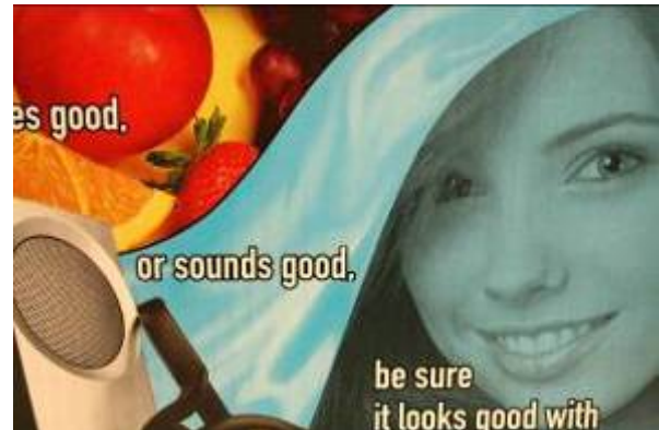
Reduced Fluting with DigiCorr

To learn more, visit www.cyrel.com or contact your local Cyrel® specialist.