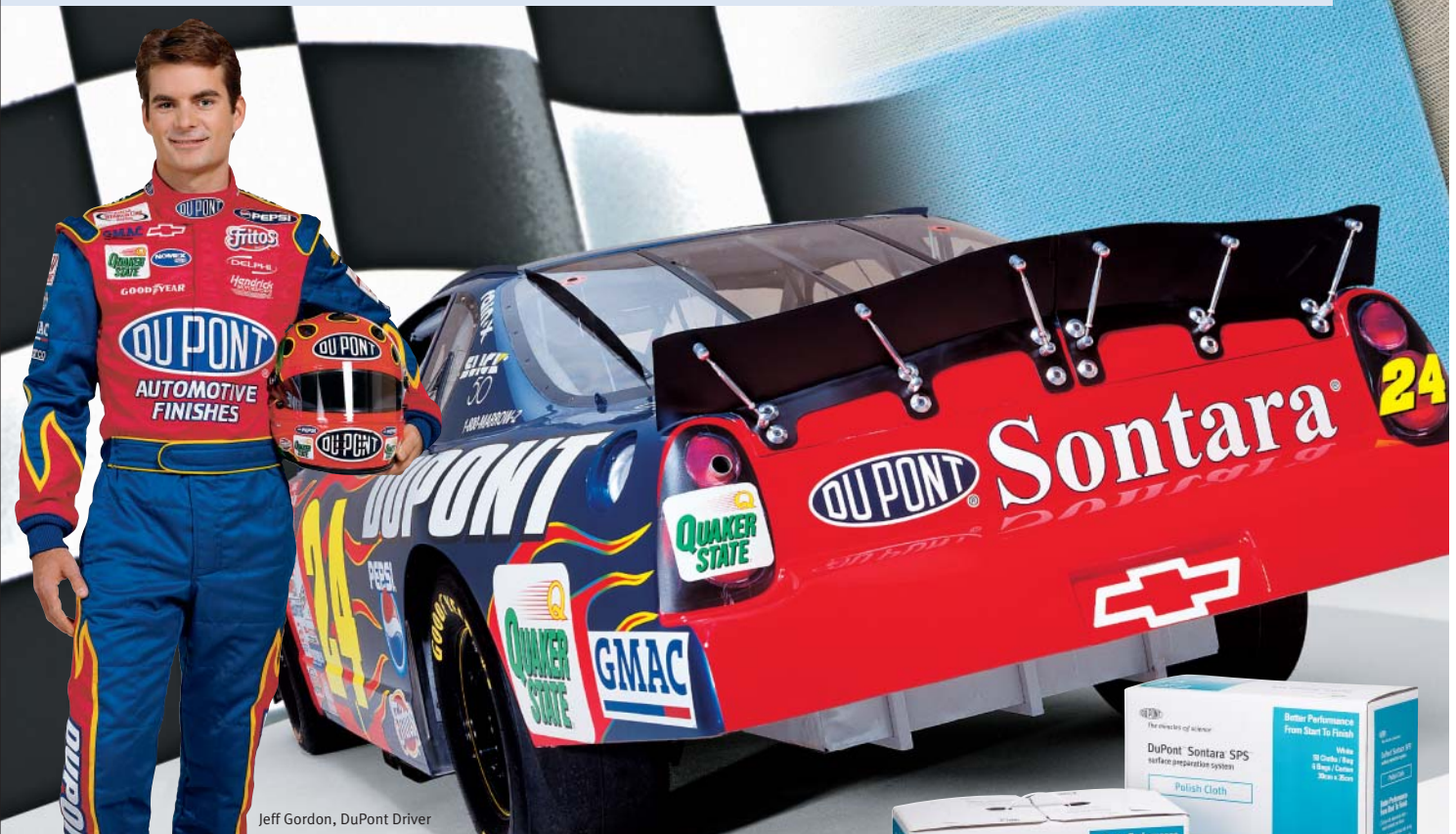
Jeff Gordon, DuPont Driver

There's A Winning Team Behind Every Great Finish.