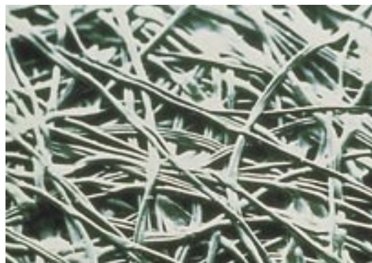
Figure 2: Typar® microscopic view

By varying the process conditions, a range of high strength Typar® nonwoven structures with different denier and physical properties can be produced. This DuPont patented production technique is one of the main reasons for the unique properties of Typar® SF compared to other geotextiles.