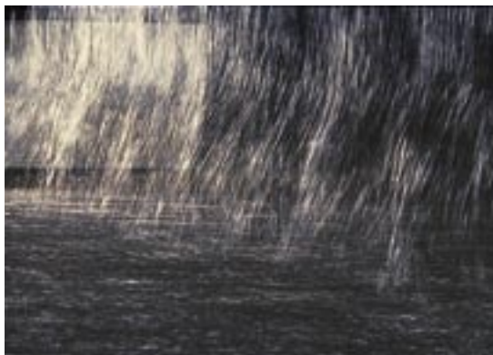
Figure 1: Filament laydown

In the fibre extrusion process, thousands of extremely fine, continuous filaments are produced, which pass through a DuPont patented “pre-stretch” stage. These fine but tough filaments are then laid down (Fig. 1) producing an isotropic fibre web sheet which is then thermally and mechanically bonded.