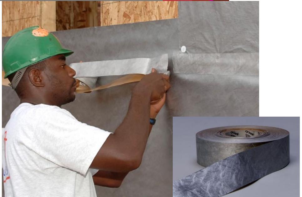
On the wall, courses of Tyvek® ThermaWrap™ are lapped shingle-style from bottom to top to shed water, while taping seams ensures an effective air barrier (above left). Best practice is to seal the joints of Tyvek® ThermaWrap™ with DuPont™ Tyvek® Metalized Tape (above right).

Reducing Radiation This is where Tyvek® ThermaWrap™ comes into play. By replacing this building wrap with Tyvek® ThermaWrap™ – a low-emissivity membrane – in any wall system with a gap of at least 3/4-inch between the framing and the siding, we create an effective thermal resistance (R-value) equal to R-2. The R-value created by Tyvek® ThermaWrap™ helps to reflect the radiant energy that has accumulated in the wall sheathing back into the wall system so it is not released to the exterior. This reduction in radiant heat flow is particularly important at the studs, plate lines, rim joists and headers, where conductive heat flow through the wall is greatest. Not only does this save energy, but by maintaining a higher sheathing temperature, Tyvek® ThermaWrap™ changes the dew point in the wall, and helps reduce the risk of condensation in wall cavities.